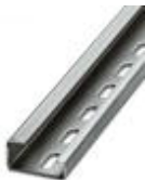
G-profile DIN rail, material: Steel, perforated, height 15 mm, width 32 mm, length 2 m

DIN rail - NS 35/15 CU UNPERF 2000MM - 1201895