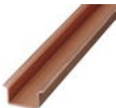
DIN rail, material: Copper, unperforated, 1.5 mm thick, height 15 mm, width 35 mm, length: 2 m

DIN rail - NS 35/15 CU UNPERF 2000MM - 1201895