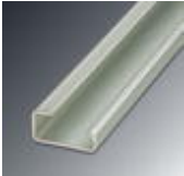
G rail 32 mm (NS 32)

DIN rail - NS 32 AL UNPERF 2000MM - 1201028