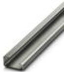
G-profile DIN rail, material: Steel, unperforated, height 15 mm, width 32 mm, length 2 m

DIN rail - NS 32 UNPERF 2000MM - 1201015