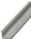
DIN rail, material: Steel, unperforated, 2.3 mm thick, height 15 mm, width 35 mm, length: 2 m

DIN rail - NS 35/15-2,3 UNPERF 2000MM - 1201798