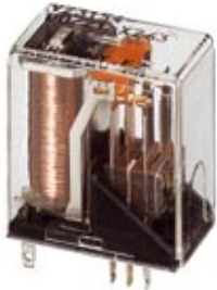
KAMMRELAIS ®, contact F 104, size 2, heavy-duty contact, 2 PDTs, input voltage 220 V DC

Please be informed that the data shown in this PDF Document is generated from our Online Catalog. Please find the complete data in the user's documentation. Our General Terms of Use for Downloads are valid ( http://phoenixcontact.com/download )