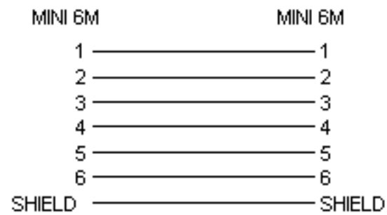
MINI DIN 6M