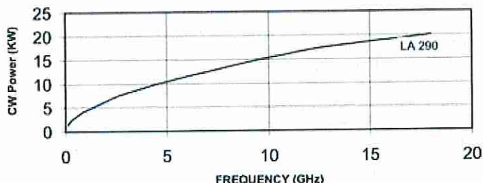
LA 290 CABLE ATTENUATION vs FREQUENCY