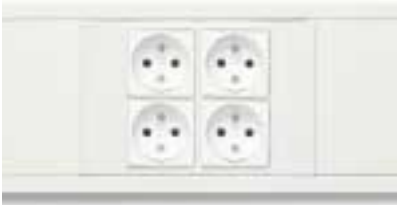
45x45 Modules (French) shown in T130FFMC.*