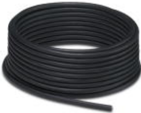
Cable ring, PVC, black, 6-pos., conductor colors: Brown / white / blue / black /gray / pink, cable length: 100 m

Please be informed that the data shown in this PDF Document is generated from our Online Catalog. Please find the complete data in the user's documentation. Our General Terms of Use for Downloads are valid ( http://download.phoenixcontact.com )