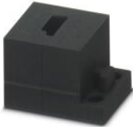
Small, slotted cable sleeves suitable for one AS-i cable, material: NBR, version: left

Please be informed that the data shown in this PDF Document is generated from our Online Catalog. Please find the complete data in the user's documentation. Our General Terms of Use for Downloads are valid ( http://phoenixcontact.com/download )