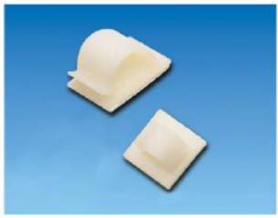
Adhesive clips come in pairs connected together on adhesive liner.