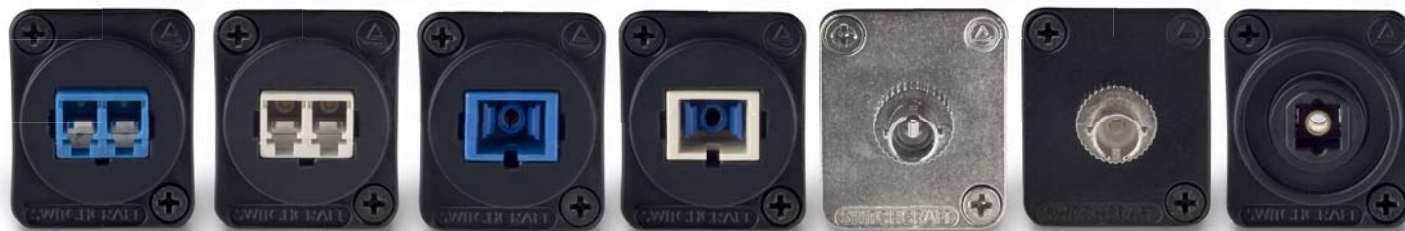
EHLC2 EHLC2M EHSC2 EHSC2M EHST2 EHST2MB EHTL2