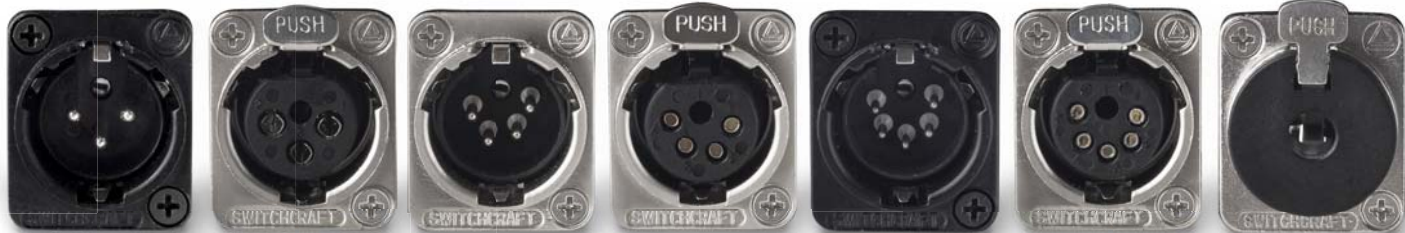
E3MSCB E3FSC E4MSC E4FSC E5MSCB E5FSC E112BL