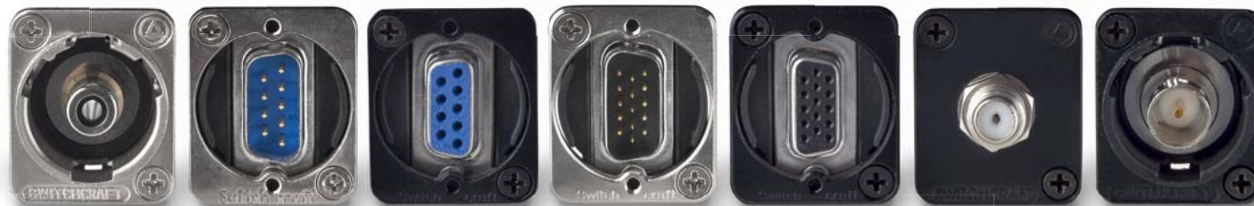
EHRCA2 EHDB9MF EHDB9FFB EHHD15MF EHHD15FFB EHFFB EHBNC2B