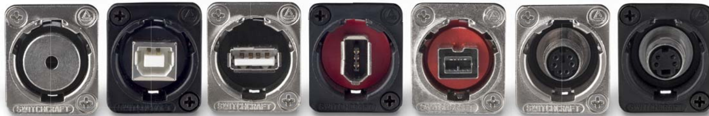
EH35MMMSC EHUSBBAB EHUSBAB EHFWX2B EHF800X2 EH6MD2 EHSVHS2B