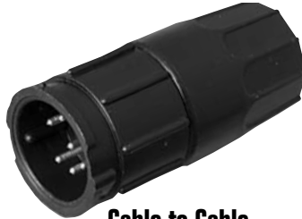
Cable to Cable 5X8X-XXG-XXX Matching Mates: • Cable Pin 3X8X-XPB-XXX • Cable Socket 3X8X-XSG-XXX