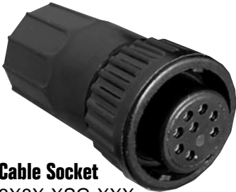
Cable Socket 3X8X-XSG-XXX Matching Mates: • Cable-Cable 5X8X-XPB-XXX • Panel 4XXX-XPB-XXX