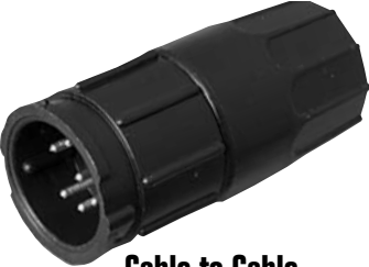
Cable to Cable 5X8X-XXG-XXX Matching Mates: • Cable Pin 3X8X-XPB-XXX • Cable Socket 3X8X-XSG-XXX