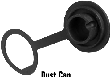
Dust Cap 4295