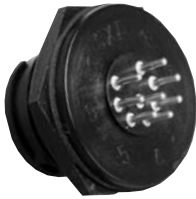
P/C Tail Panel Mount 4XXX-XXG-XXX Matching Mates: • Cable Pin 3X8X-XPB-XXX • Cable Socket 3X8X-XSG-XXX