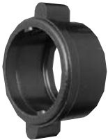
Winged Coupling Ring W/4482