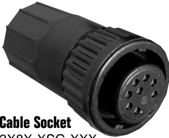
Cable Socket 3X8X-XSG-XXX Matching Mates: • Cable-Cable 5X8X-XPB-XXX • Panel 4XXX-XPB-XXX