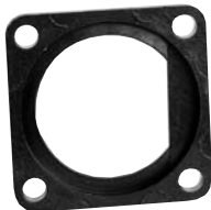
Square Flange Adapter 4296