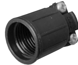
Mechanical Back Shell (Style #5)