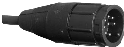
Cable to Cable