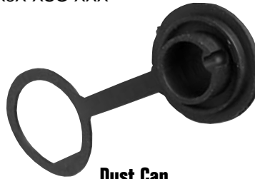
Dust Cap 4295