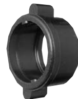
Winged Coupling Ring W/4482