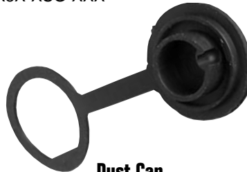
Dust Cap 4295