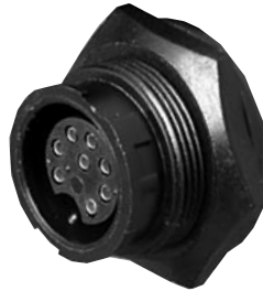
Panel Mount 4X8X-XXG-XXX Matching Mates: • Cable Pin 3X8X-XPB-XXX • Cable Socket 3X8X-XSG-XXX