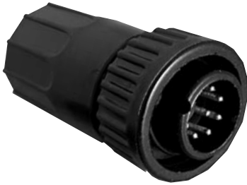
Cable Pin 3X8X-XPB-XXX Matching Mates: • Cable-Cable 5X8X-XSG-XXX • Panel 4XXX-XSG-XXX