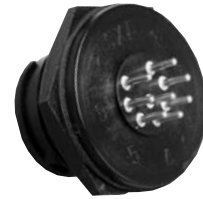
P/C Tail Panel Mount 4XXX-XXG-XXX Matching Mates: • Cable Pin 3X8X-XPB-XXX • Cable Socket 3X8X-XSG-XXX