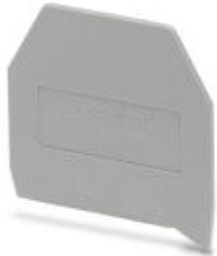
End cover, Length: 43 mm, Width: 1.5 mm, Color: gray

Please be informed that the data shown in this PDF Document is generated from our Online Catalog. Please find the complete data in the user's documentation. Our General Terms of Use for Downloads are valid ( http://phoenixcontact.com/download )