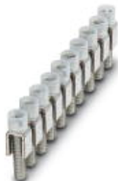
Fixed bridge, Number of positions: 10, Color: silver

Please be informed that the data shown in this PDF Document is generated from our Online Catalog. Please find the complete data in the user's documentation. Our General Terms of Use for Downloads are valid ( http://download.phoenixcontact.com )