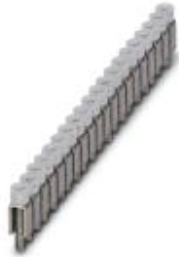
Fixed bridge, Number of positions: 20, Color: silver

Please be informed that the data shown in this PDF Document is generated from our Online Catalog. Please find the complete data in the user's documentation. Our General Terms of Use for Downloads are valid ( http://download.phoenixcontact.com )