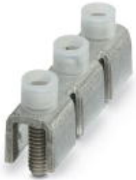
Fixed bridge, Number of positions: 3, Color: silver

Please be informed that the data shown in this PDF Document is generated from our Online Catalog. Please find the complete data in the user's documentation. Our General Terms of Use for Downloads are valid ( http://phoenixcontact.com/download )