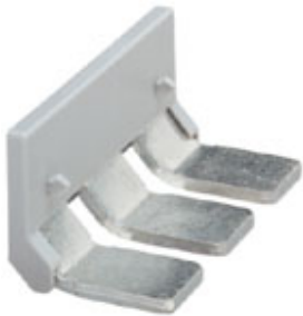
Insertion bridge, Number of positions: 3, Color: gray

Please be informed that the data shown in this PDF Document is generated from our Online Catalog. Please find the complete data in the user's documentation. Our General Terms of Use for Downloads are valid ( http://phoenixcontact.com/download )