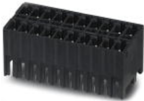
The figure shows a 10-pos. version with 20 contacts

Please be informed that the data shown in this PDF Document is generated from our Online Catalog. Please find the complete data in the user's documentation. Our General Terms of Use for Downloads are valid ( http://phoenixcontact.com/download )