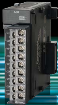
NEW Analog input unit high-speed and multi-channel type AFP7AD8