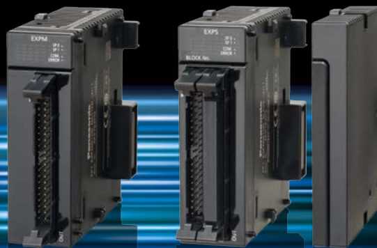
NEW Expansion master unit AFP7EXPM

Three blocks can be expanded on one CPU unit. Distributed installation achieved while maintaining high-speed bus transmission.