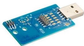
Figure 5: uSSD External USB Adapter

An adapter is available to assist customers in evaluating the uSSD 5000. The adapter enables inserting the uSSD 5000 in an external desktop or laptop USB port.