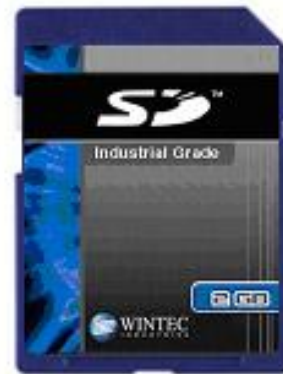
Wintec Secure Digital Card

Wintec Secure Digital Cards employ a variety of sophisticated error checking and flash management utilities allowing for maximum levels of data reliability and card endurance. Patented wear-leveling methods ensure even wear of flash blocks across the entire card capacity. Background operations track erase counts, prioritize new writes to blocks with lower wear, and relocate static data to blocks with higher wear. Bad-block Management routines replace worn