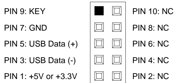
Figure 1: 10-pin socket pinout