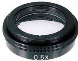
Auxiliary Lens 0.5x Product # 26800B-461