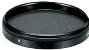
Protective Lens Cover Product # 26800B-465