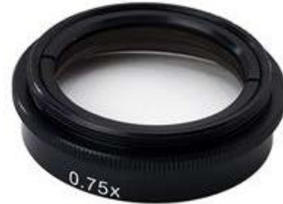
Auxiliary Lens 0.75x Product # 26800B-462