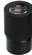
DSW-10X - DSZ-44 and NSW series bodies Product # 26800B-441