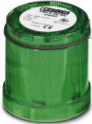
Permanent light element, 12 to 240 V AC/DC, green, without bulb

Please be informed that the data shown in this PDF Document is generated from our Online Catalog. Please find the complete data in the user's documentation. Our General Terms of Use for Downloads are valid ( http://phoenixcontact.com/download )