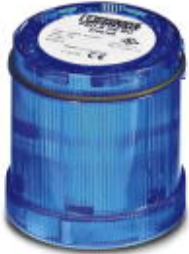
Permanent light element, 12 to 240 V AC/DC, blue, without bulb

Please be informed that the data shown in this PDF Document is generated from our Online Catalog. Please find the complete data in the user's documentation. Our General Terms of Use for Downloads are valid ( http://phoenixcontact.com/download )