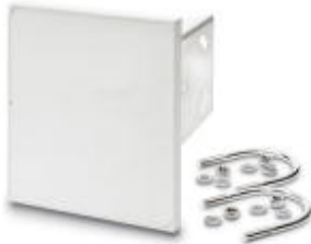
Flat panel antenna, 5 GHz, gain 18 dBi, connection N (female), IP55

Please be informed that the data shown in this PDF Document is generated from our Online Catalog. Please find the complete data in the user's documentation. Our General Terms of Use for Downloads are valid ( http://download.phoenixcontact.com )