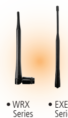
• WRX Series • EXE Series