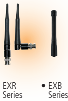
• EXR Series • EXB Series