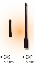
• EXS Series • EXP Series