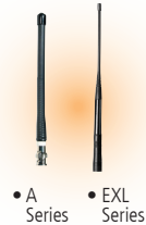
• A Series • EXL Series