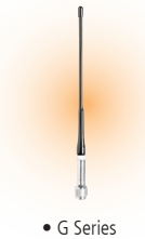
• G Series