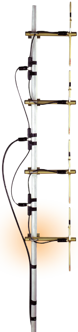
• 4 Bay Dipole Array