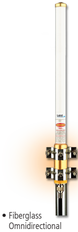
• Fiberglass Omnidirectional