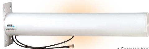
• Enclosed Yagi