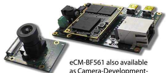
eCM-BF561 also available as Camera-Development-Kit (CDK)